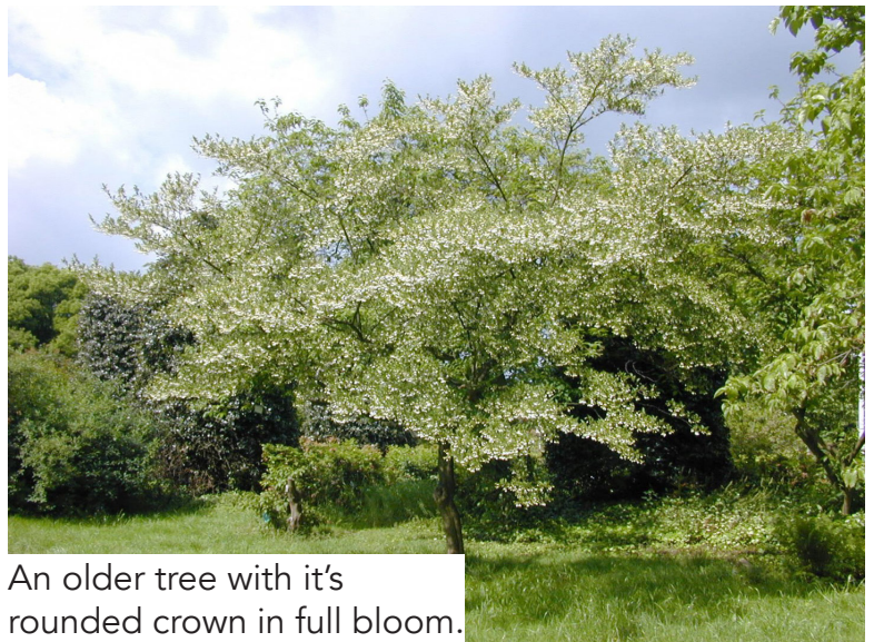
An older tree with its rounded crown in full bloom.