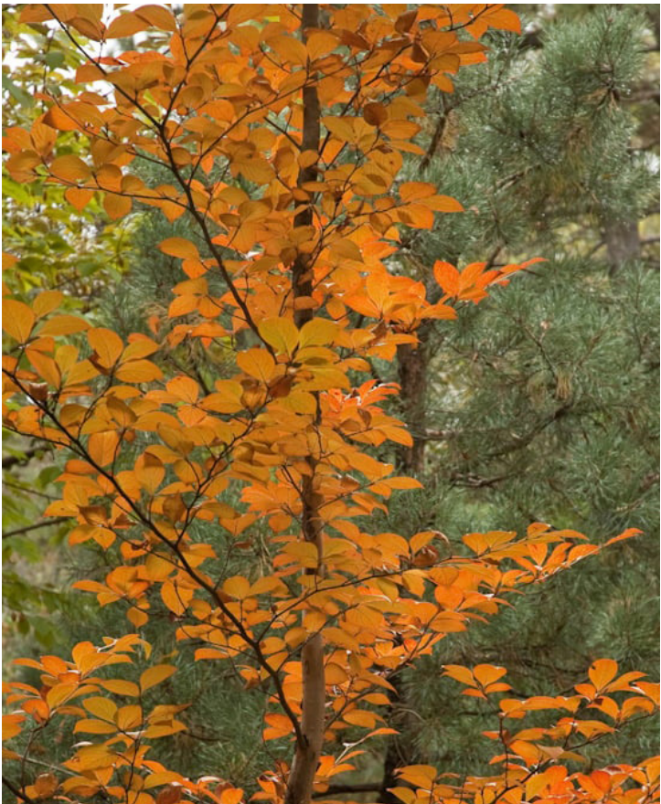
The Japanese snowbell is dynamic throughout the seasons- The fall foliage varies from red to yellow (as seen below) and the leaves emerge in early spring (Right&below)