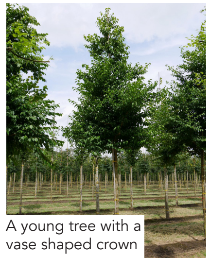
A young tree with a vase shaped crown